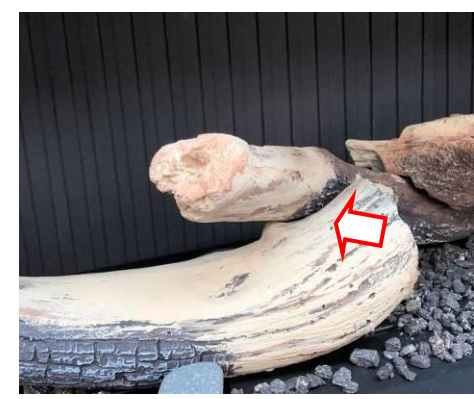
Log locating bump on log