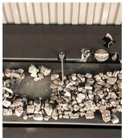
Keep Vermiculite away from directly in front of the Pilot