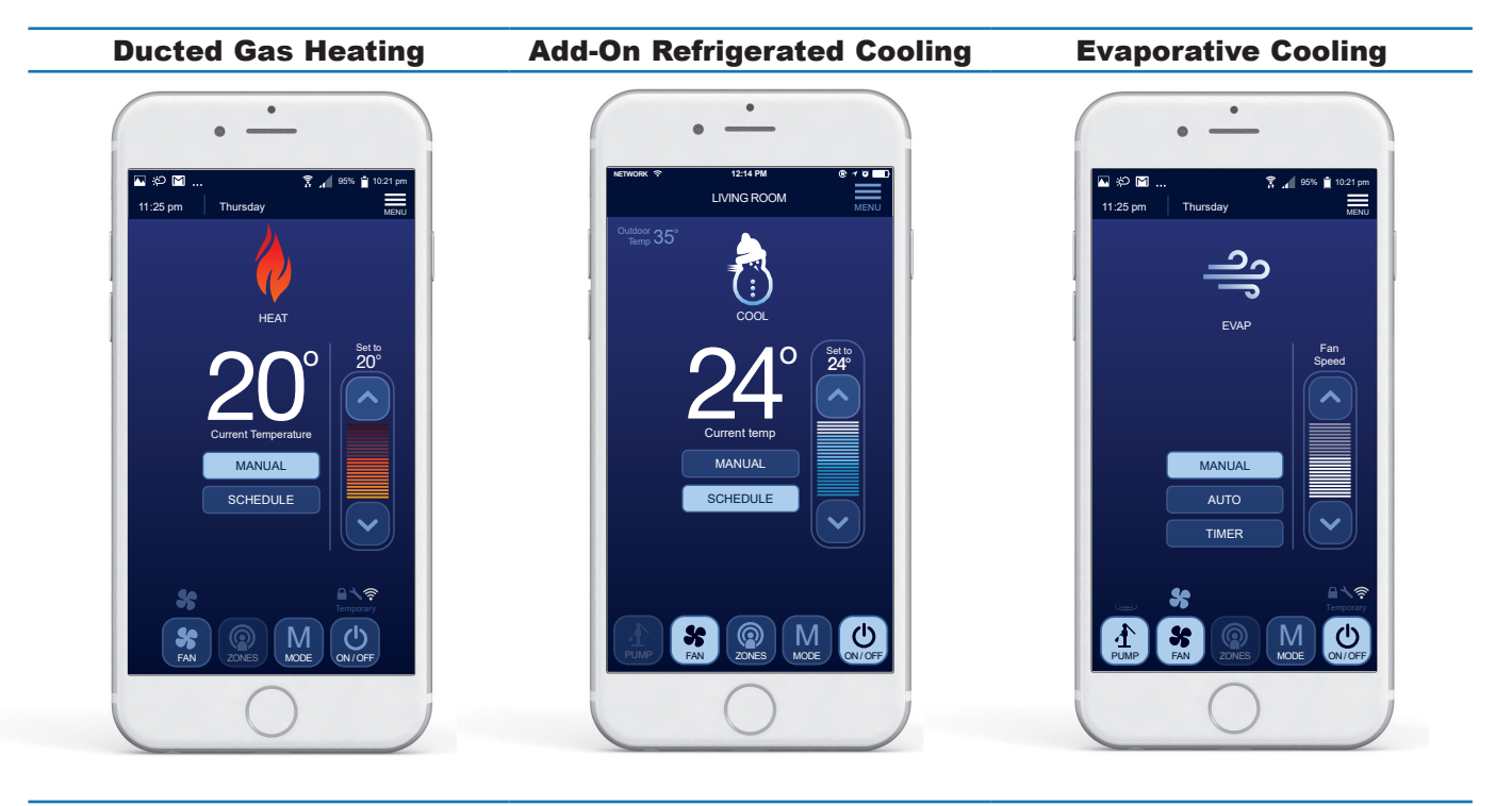
Single Temperature Set Point (STSP) Zoning