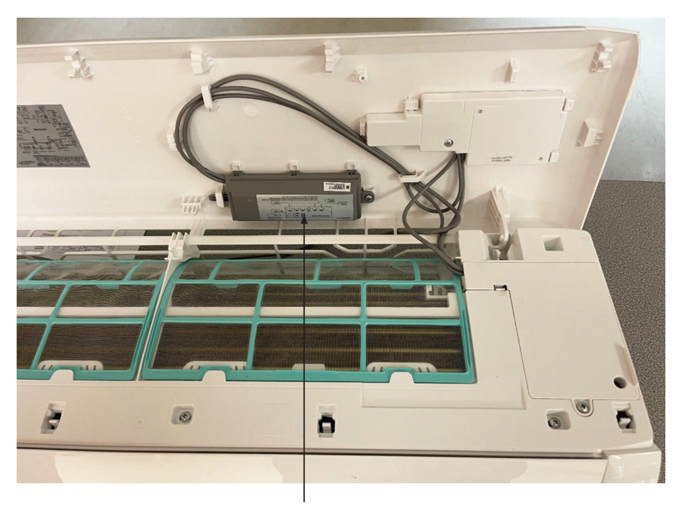
Multi-Function box installed