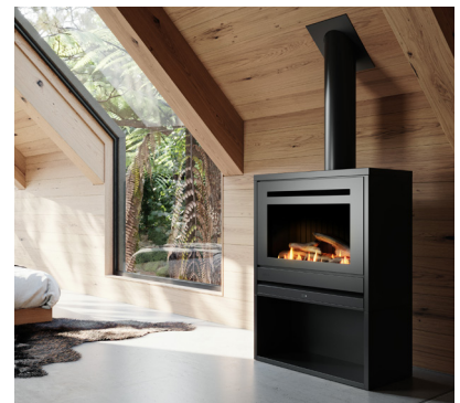
Novo Cube on cabinet base